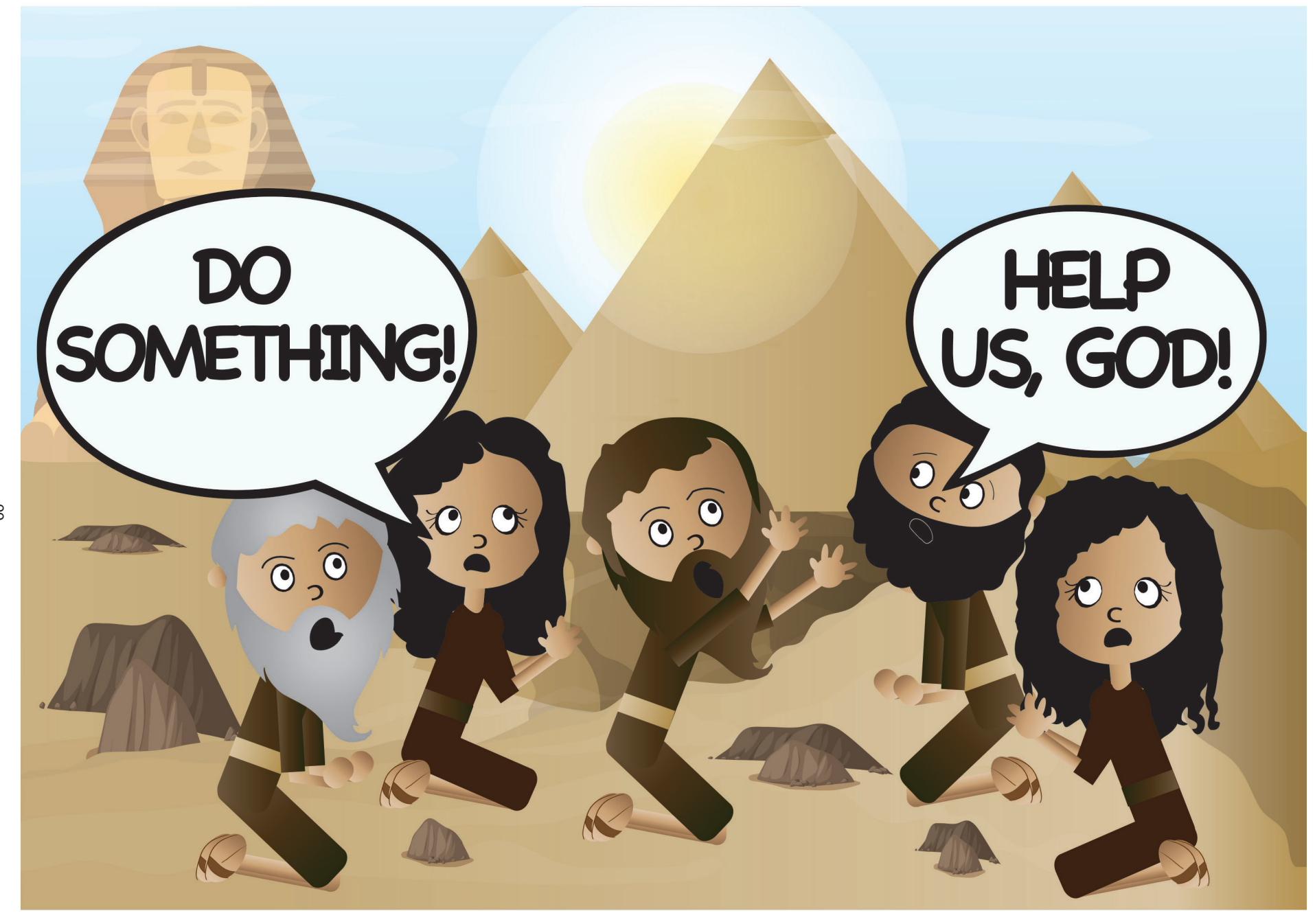
2. "Help us, LORD! Help us! DO SOMETHING!" God's people cried out.