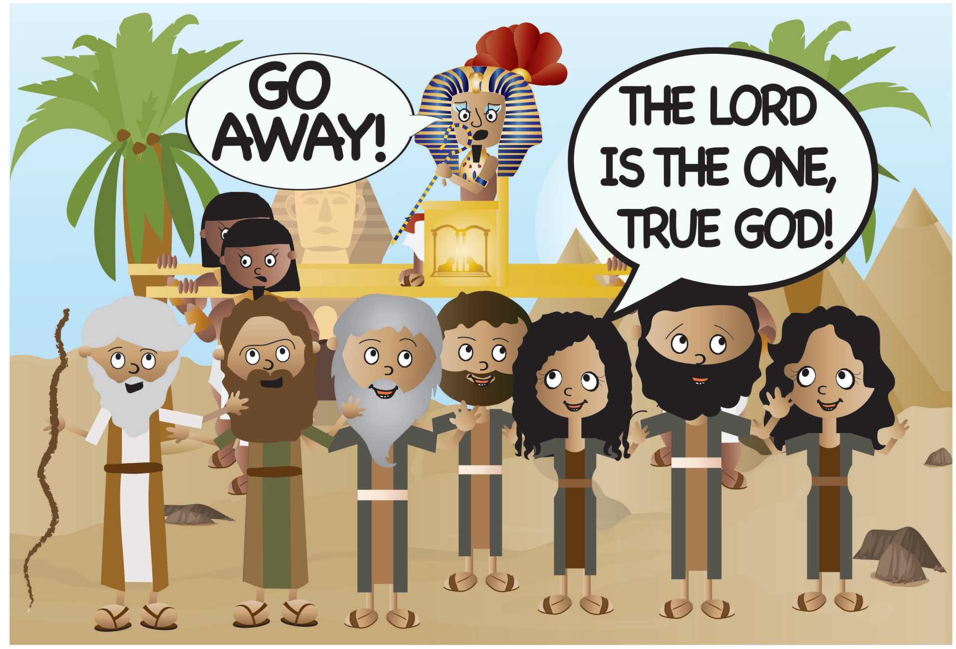
6. God's people praised the LORD. He had made the mighty, mean king free them. And, He showed the whole world He really is the one, true God!