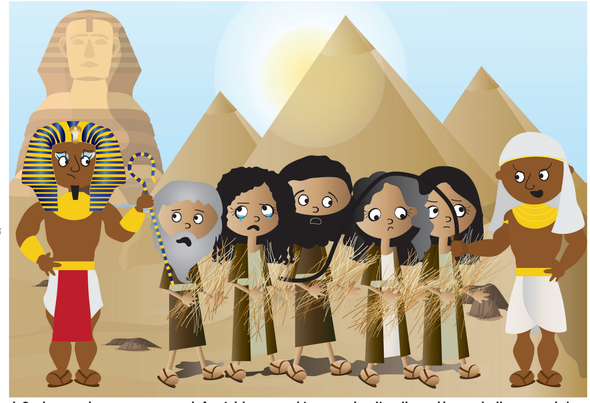
I. God's people were very sad. A mighty, mean king was hurting them. He made them work too hard. He didn't take care of them. He wouldn't let them go home.