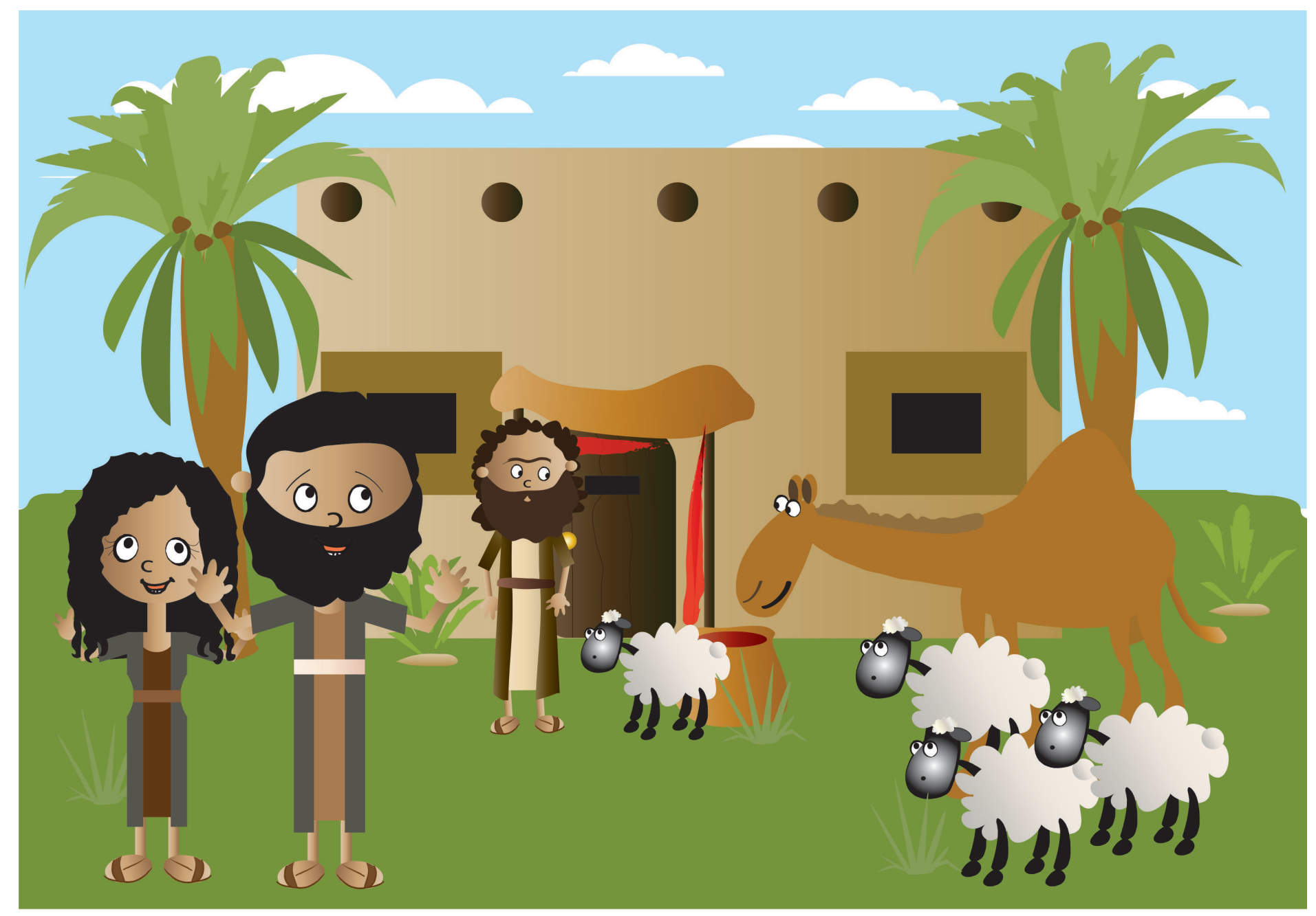
5. But the LORD protected His people from all the sad things.