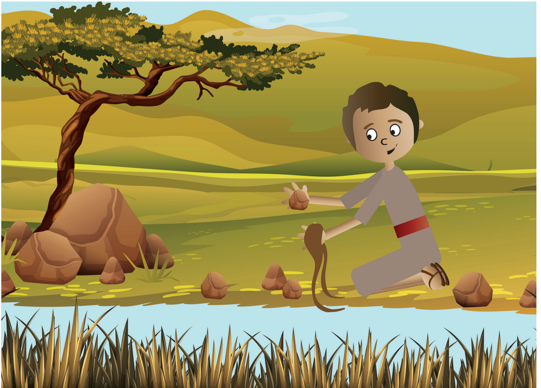
7. David went down to the stream and gathered stones for his sling.