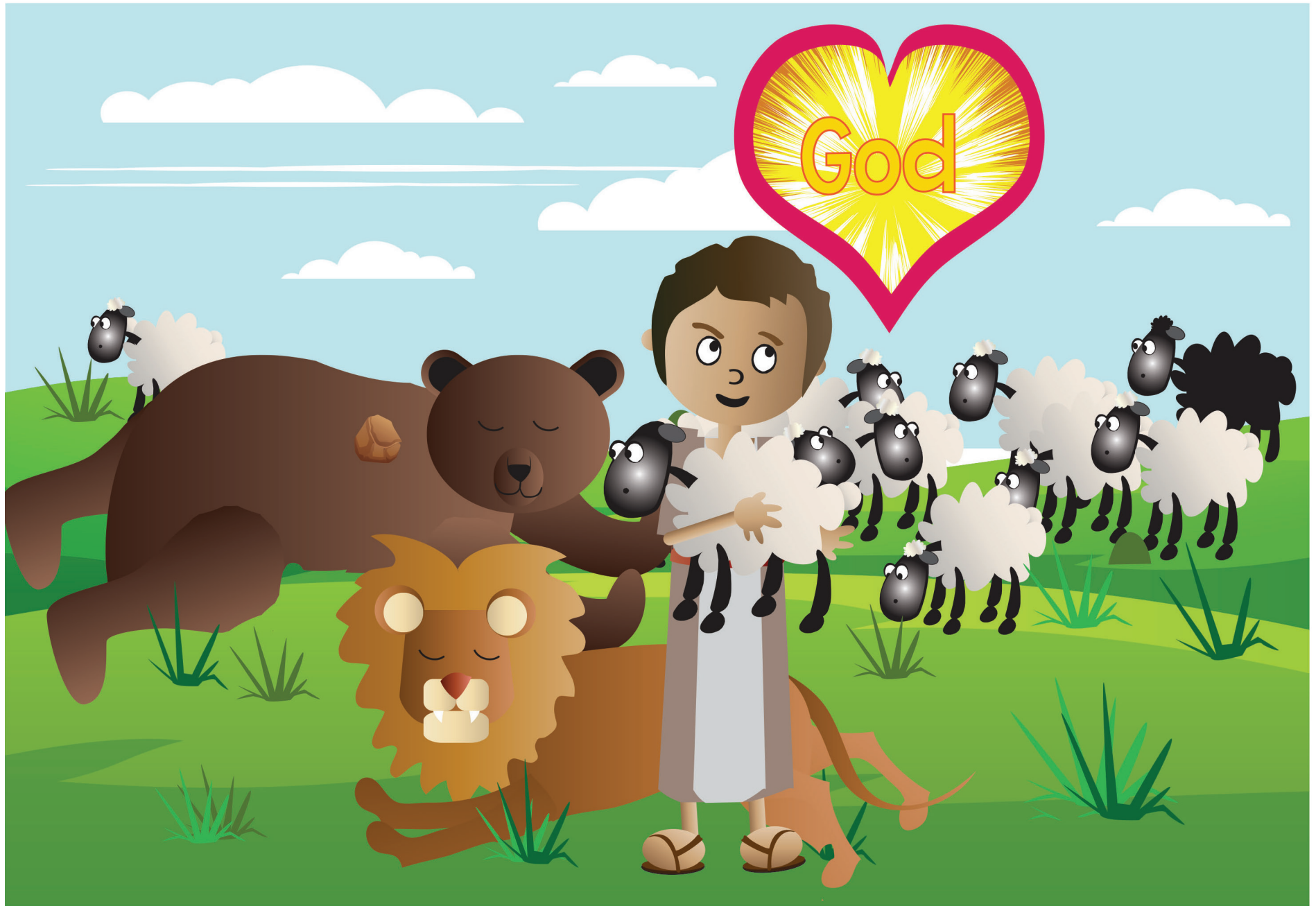
3. David praised God for his help!