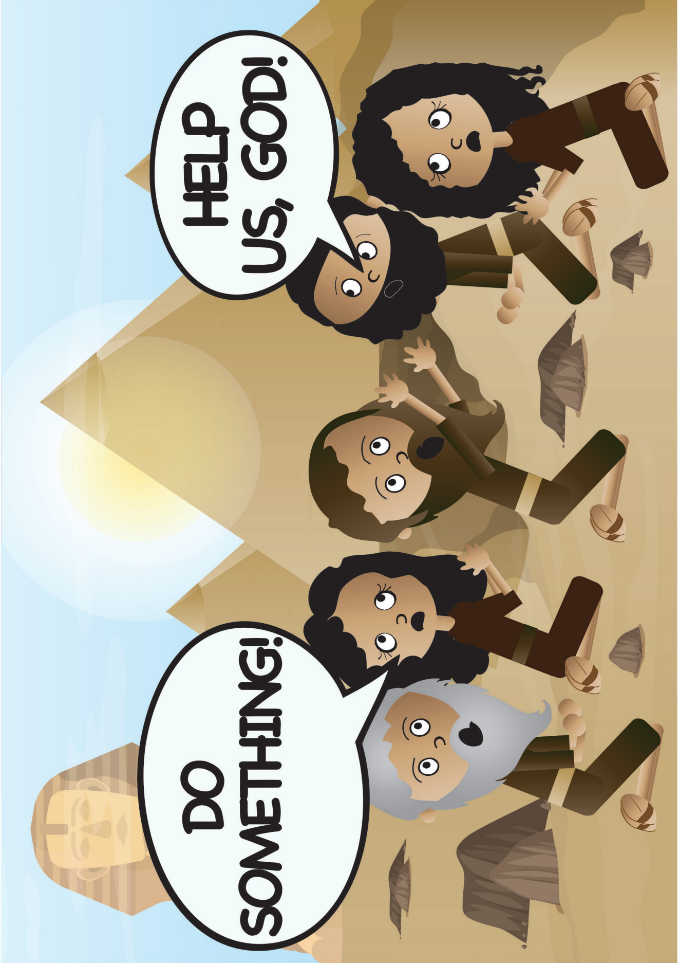
2. "Help us, LORD! Help us! DO SOMETHING!" God's people cried out.