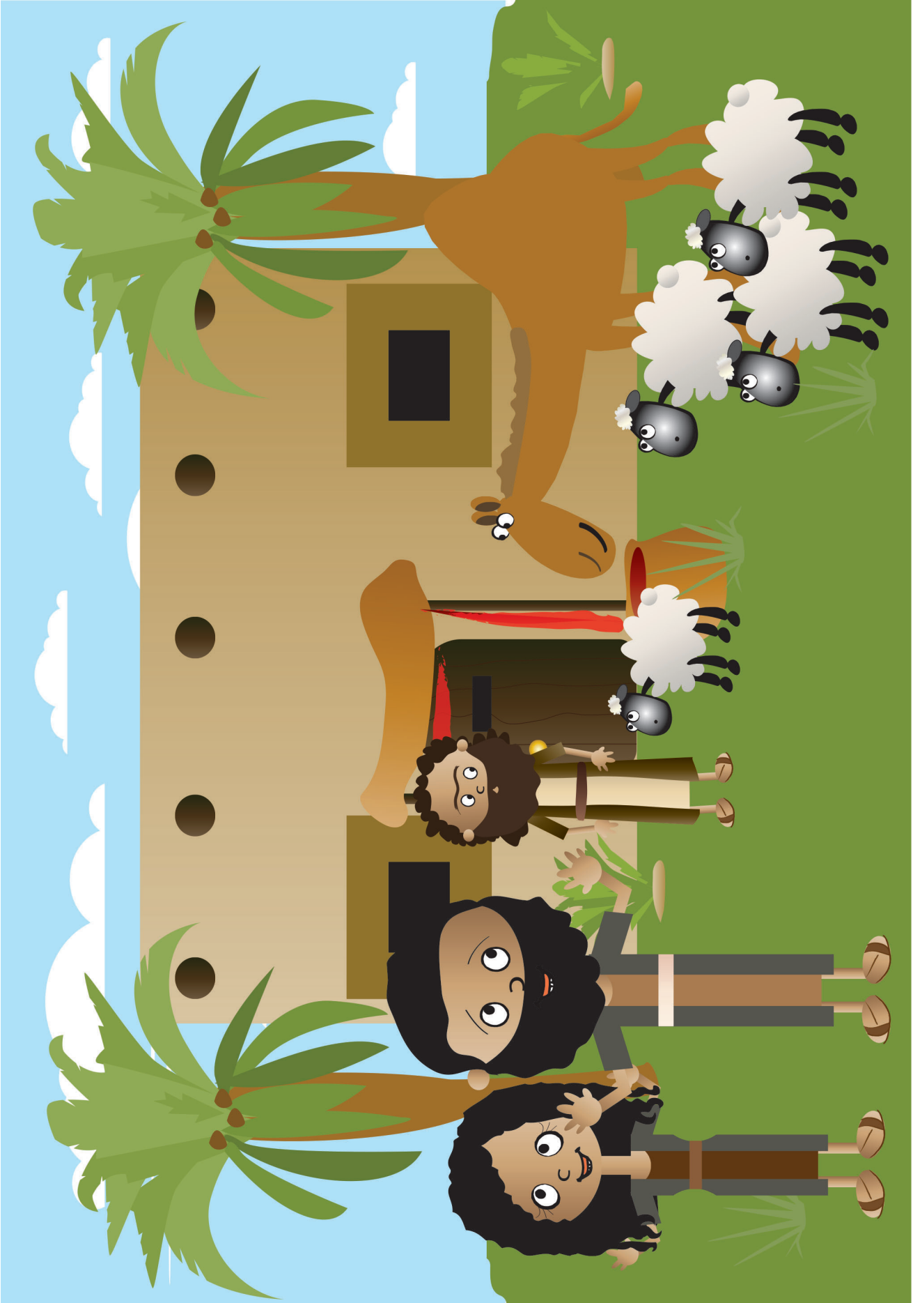
5. But the LORD protected His people from all the sad things.